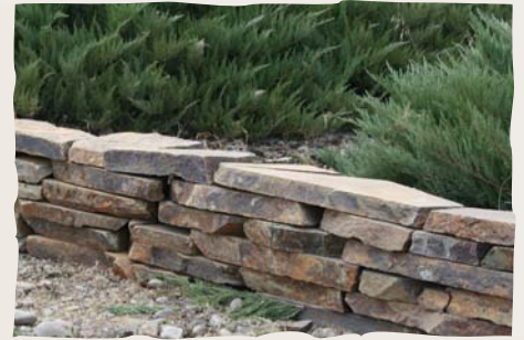
AUTUMN FLAME 3-5" PATIO