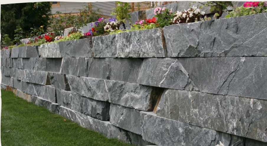
OCEAN PEARL 8" CUT WALLSTONE