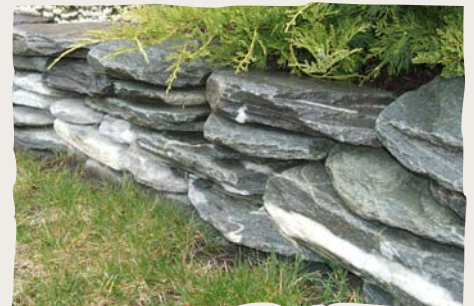
OCEAN PEARL SAUCERS