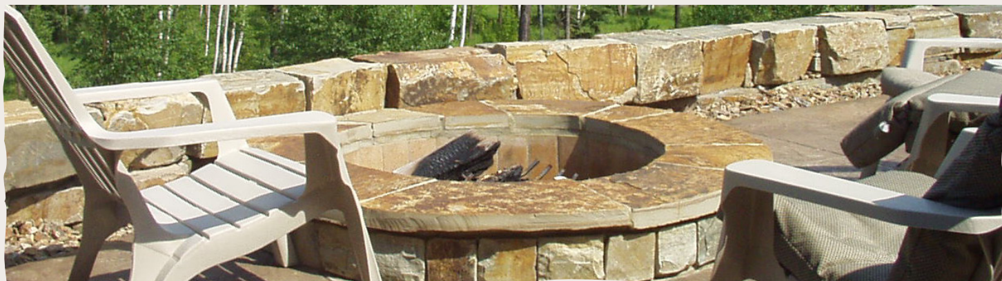
AUTUMN GOLD FIRE PIT