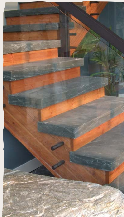
CUSTOM CUT STAIRS