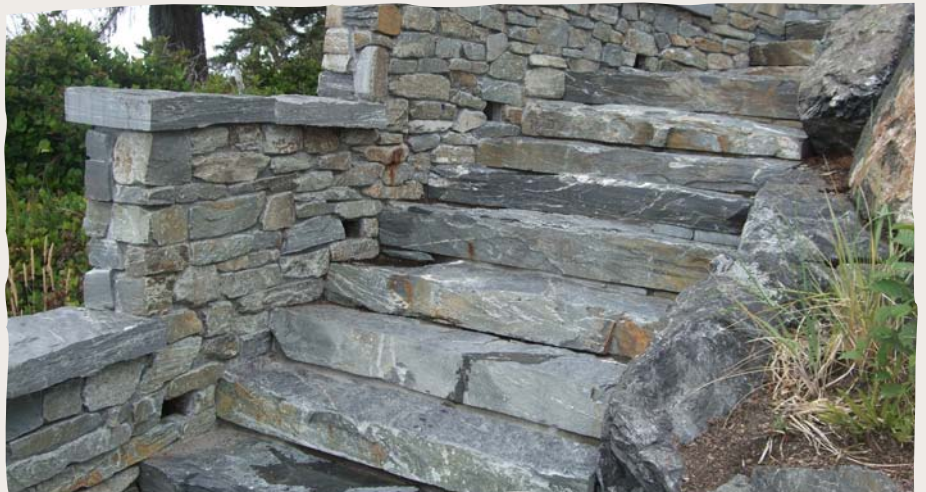
OCEAN PEARL NATURAL STAIRS

The most natural, rustic looking stairs available. Ocean Pearl Natural Stairs are composed of slate, making them slip resistant. The color blends exactly with the rest of the Ocean Pearl line. Large slabs also available.