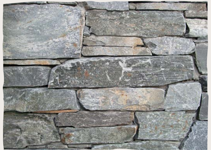
OCEAN MIST LEDGESTONE