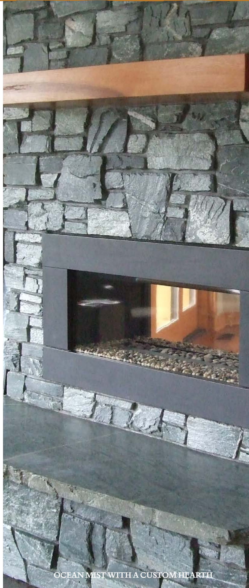
OCEAN MIST WITH A CUSTOM HEARTH