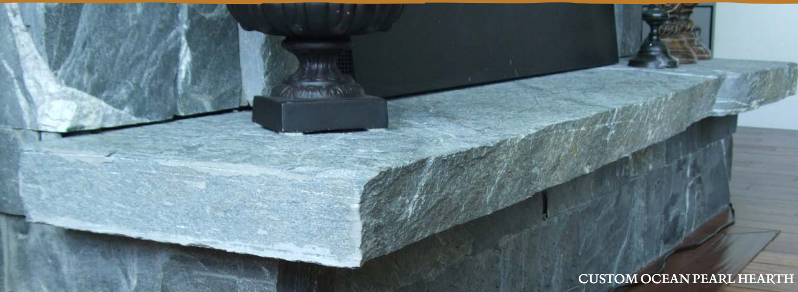
CUSTOM OCEAN PEARL HEARTH