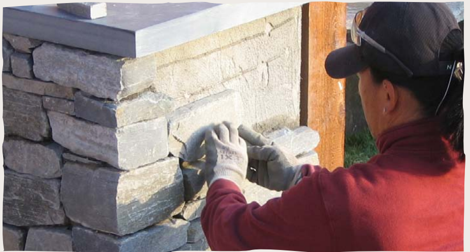
STONE VENEER AS IT IS APPLIED