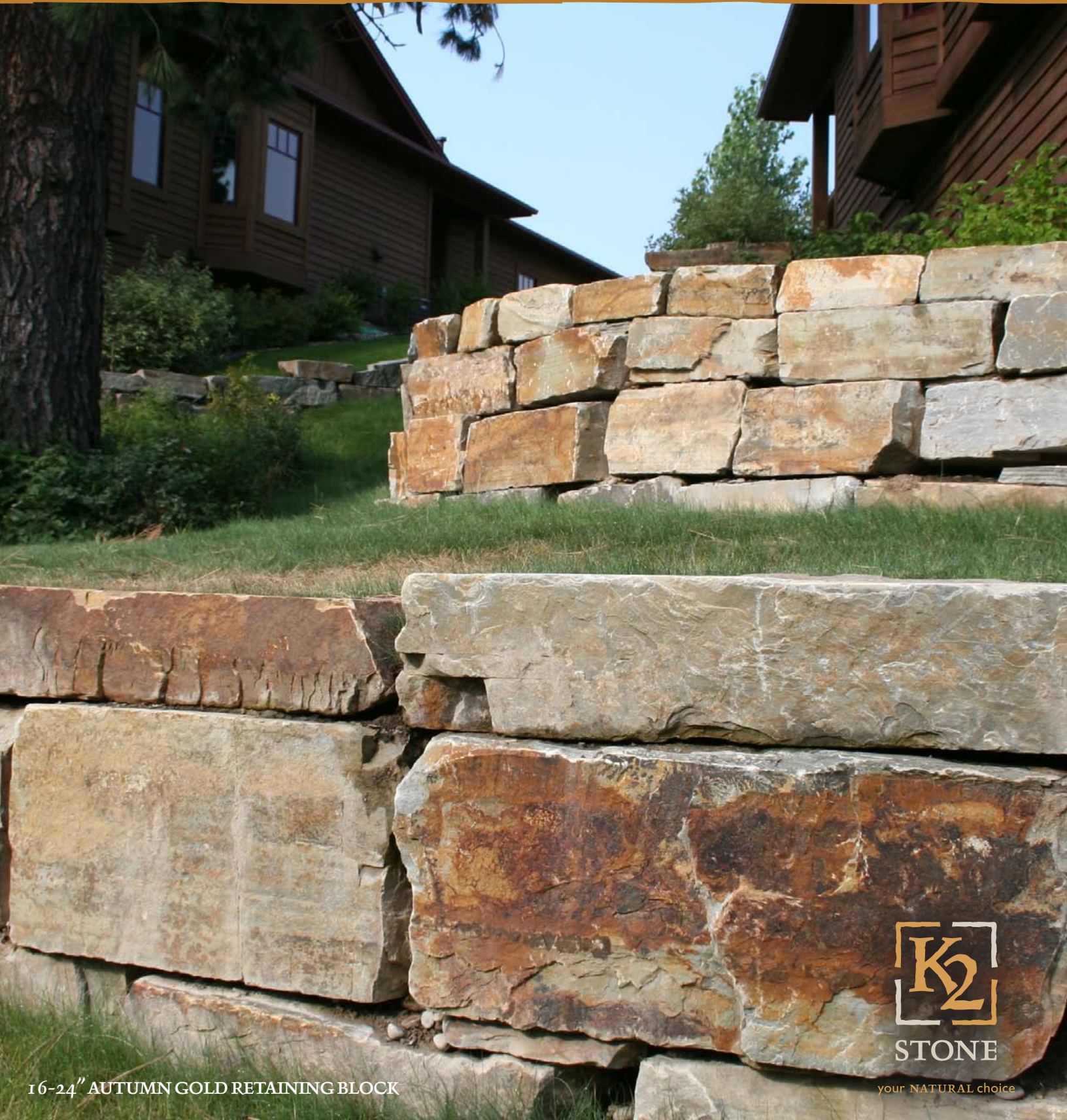
16-24" AUTUMN GOLD RETAINING BLOCK