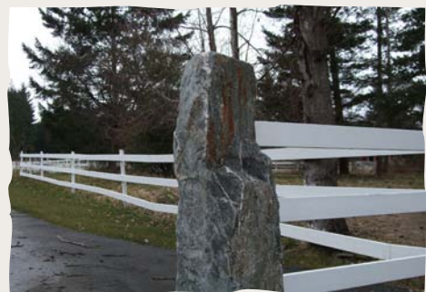
OCEAN PEARL COLUMN