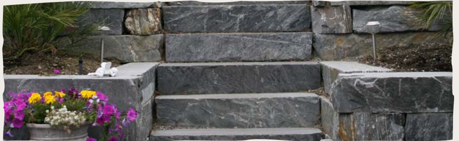
OCEAN PEARL 8" CUT WALLSTONE STAIRS

Cut Wallstone Stair treads are the most unique in the industry. With exact rise heights and a naturally non slip tread. 8" cut wallstone stairs blend their natural look with a safe surface.