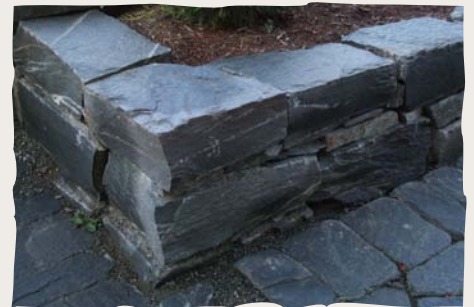
OCEAN PEARL CASTLE ROCK