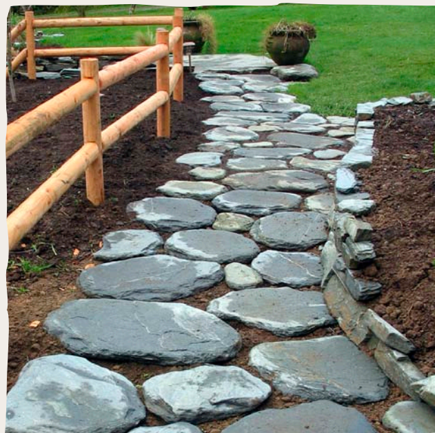
OCEAN PEARL STEPPING STONES