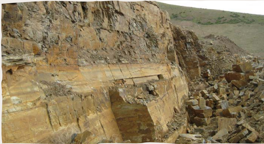
PERMA GOLD QUARRY IN MONTANA

As both the quarry and distributor, K2 Stone is able to uphold industry leading quality standards, and provide an unmatched level of customization. We have 6 quarries and 2 production facilities. Our distribution facilities stock a wide range of stone products to ensure we can serve you better. We strive to support the communities where we live, work and operate in an environmentally responsible manner.