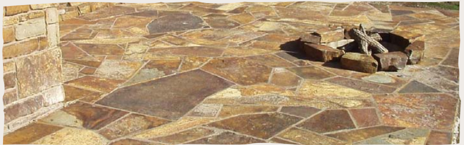
AUTUMN FLAME FLAGSTONE

"Patio" or "Lay down" flagstone is small enough to fit on a pallet, as the name suggests.