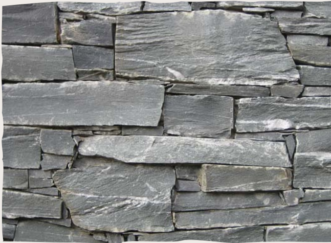
BLACK PEARL LEDGESTONE