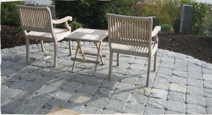
OCEAN PEARL COBBLES