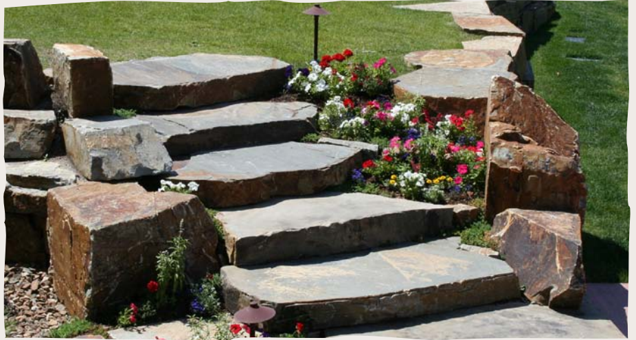
AUTUMN GOLD STAIRS

Autumn Gold Stairs offer exceptionally consistent tread surfaces without the need for any cuts. These stairs have brown and gold coloring that match well with wood and provide an excellent hardscape accent. Large slabs also available.