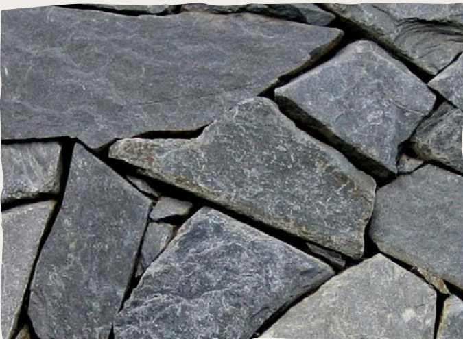
TOFINO SKY FIELDSTONE