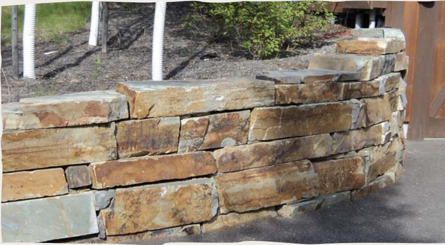
AUTUMN GOLD RETAINING BLOCK