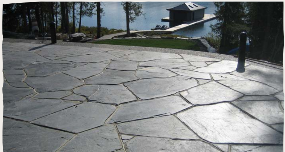
OCEAN PEARL FLAGSTONE