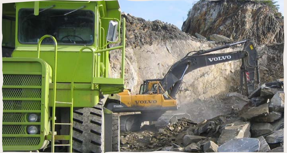
OCEAN PEARL QUARRY ON VANCOUVER ISLAND BC

K2 Stone is one of the largest producers and distributors of natural stone products for the building industry in Western North America. We specialize in thin stone veneers, full bed masonry stone, cap stones, flag stones, hearths, mantels, landscape stone as well as a variety of custom products. We employ a fully vertically integrated business model which ensures unique products at competitive prices and outstanding service to our customers.