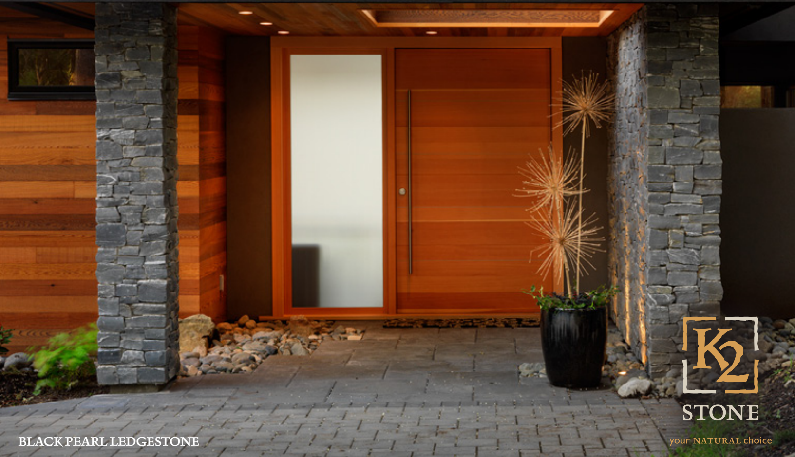
BLACK PEARL LEDGESTONE