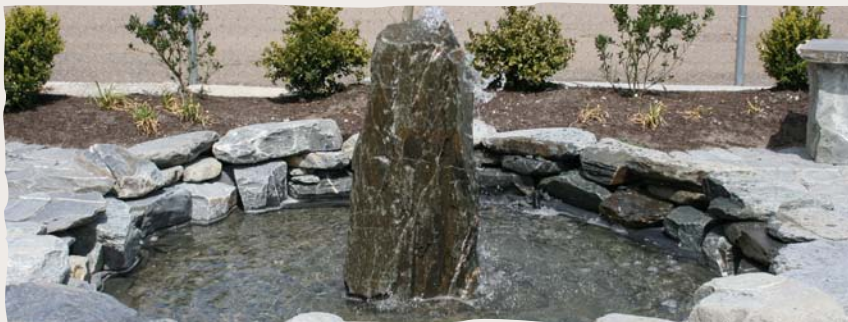
GURGLER AND POND ROCKS