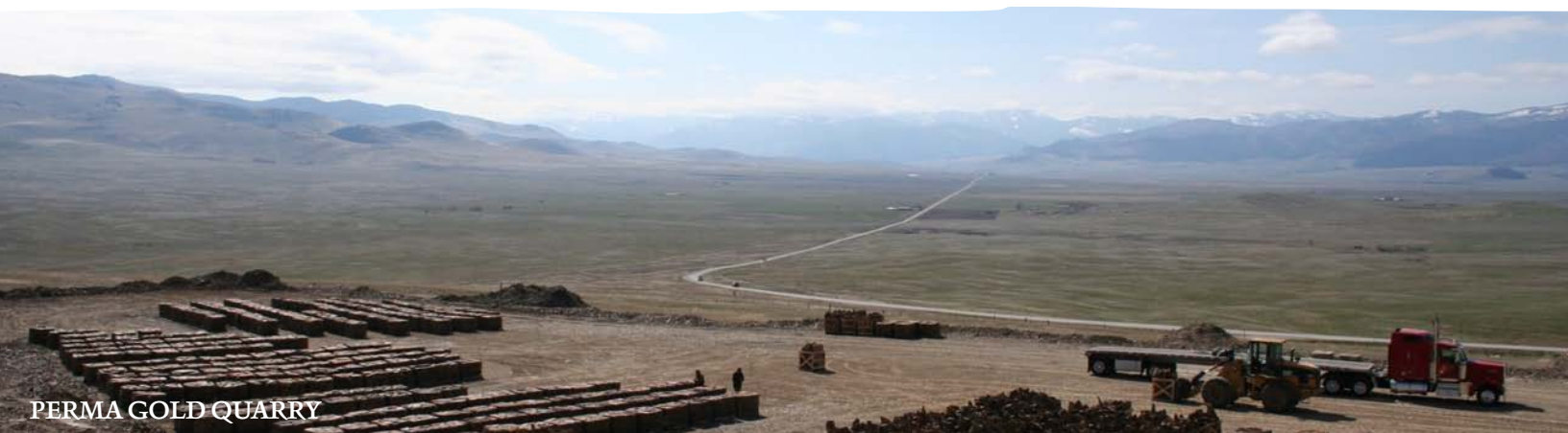
PERMA GOLD QUARRY

As both the quarry and distributor, K2 Stone is able to uphold industry leading quality standards, and provide an unmatched level of customization. We have 6 quarries and 2 production facilities. Our distribution facilities stock a wide range of stone products to ensure we can serve you better. We strive to support the communities where we live, work and operate in an environmentally responsible manner.