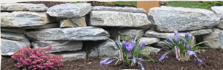
OCEAN PEARL WALLSTONE